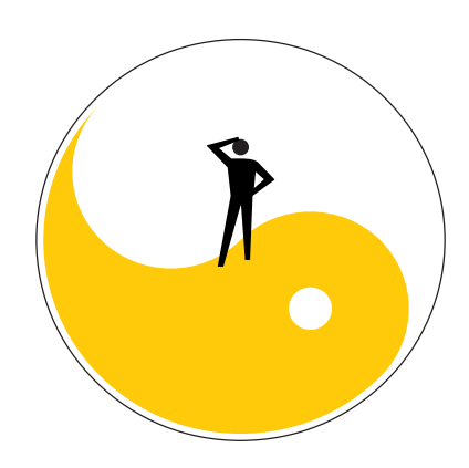
Figure 1: The Convenience Paradox ideogram points to a better way of making choices — by relying on suitably designed information. The more convenient condition is reached by taking the informed choice — and the seemingly less convenient direction (uphill).

The Convenience Paradox shows how polyscopy might be used to broaden the "narrow frame" and undo the damages it has caused to culture.